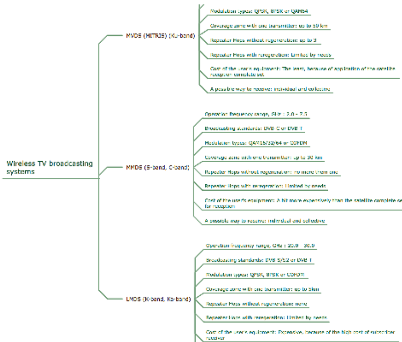
This mind map represents a list of Wireless TV Broadcasting systems. It was created using ConceptDraw MINDMAP

"I utilize a significant number of icons from the included libraries, but recently I have been experimenting with ConceptDraw's Live-Object capability, which connects my Excel files to my ConceptDraw PRO diagrams."